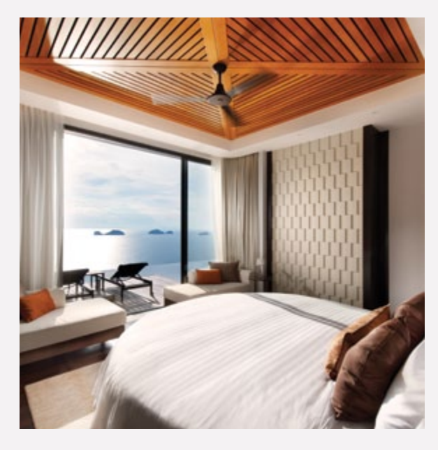
Each master bedroom opens directly onto the pool terrace