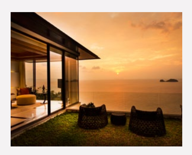
An emerald lawn replete with seating area during the sunset

Turtle Kid's Club will entertain younger family members with a wide range of fun and engaging activities including; cultural arts and handicrafts, indoor and outdoor games and babysitting services.