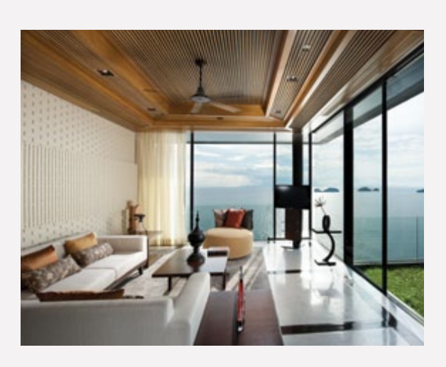
Living room and outdoor viewing lawn

The upper floor entrance opens onto an emerald lawn replete with seating area from which to view the sprawling seascape below. The open foyer encompasses a living room with comprehensive entertainment system, powder room, a functional kitchenette and a dining area for stylish gatherings.