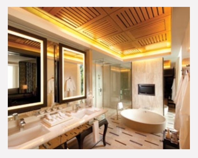
En-suite bathrooms feature spa-quality amenities