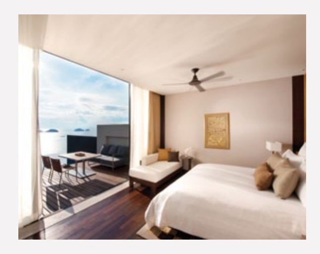
The second bedroom, complete with king bed or twin beds options